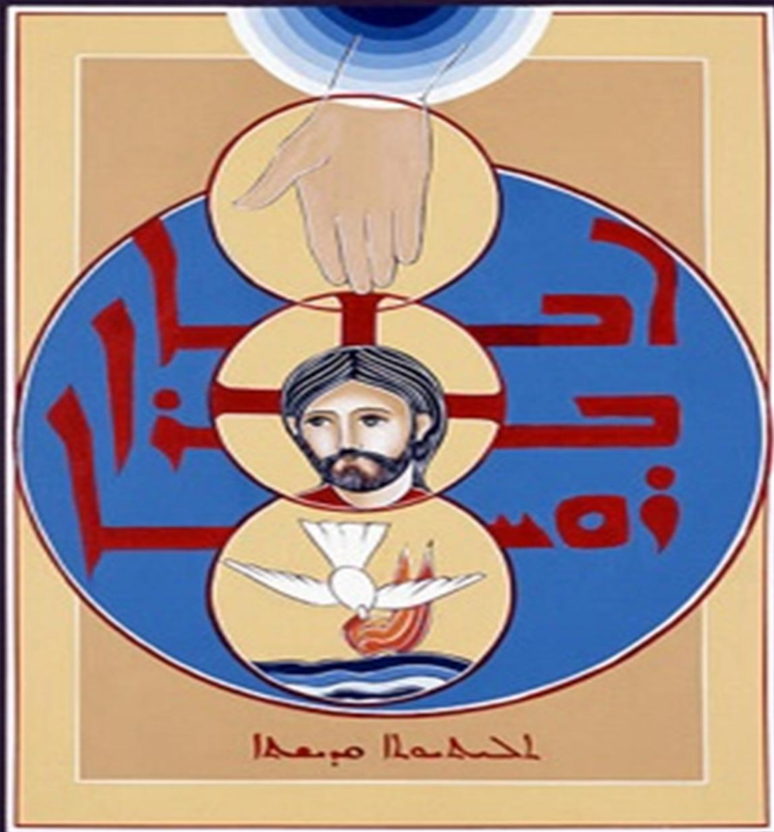
Icon: "Who could define the mystery of the Holy Trinity which fills the heights and the depths and inscrutable: the Father begot the Only Son, the First Born Son became man, and the Holy Spirit achieved this. Glory to the One who is invisible and illimitable in his nature; Praised in three person in one unique sovereignty and praised by all creatures."