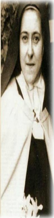
St. Thérèse of Lisieux

"Our Lord does not look so much at the greatness of our actions, or even at their difficulty, as at the love with which we do them."